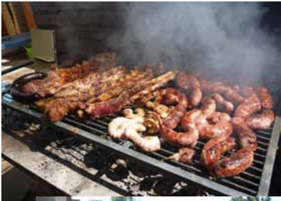
Asado & Pileta!

In March we had many Social meetings. Amongst all these wonderful moments with the volunteers we had an asado, went to a reggae concert, had drinks, enjoyed the wonderful ambiance of Dada Mini Bar, participated in a Adobe construction & helped two individual organisations for a day. Thanks to all of you who take the time and effort to attend our Socials as you make it possible to have a good time together!